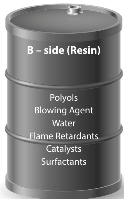
Components of Spray Foam